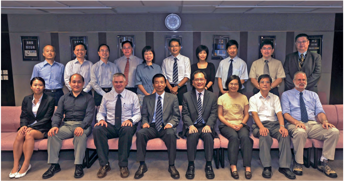
海岸公園委員會的委員在二〇〇九年七月十六日的會議上合照 Members of the Marine Parks Committee at a meeting held on 16 July 2009