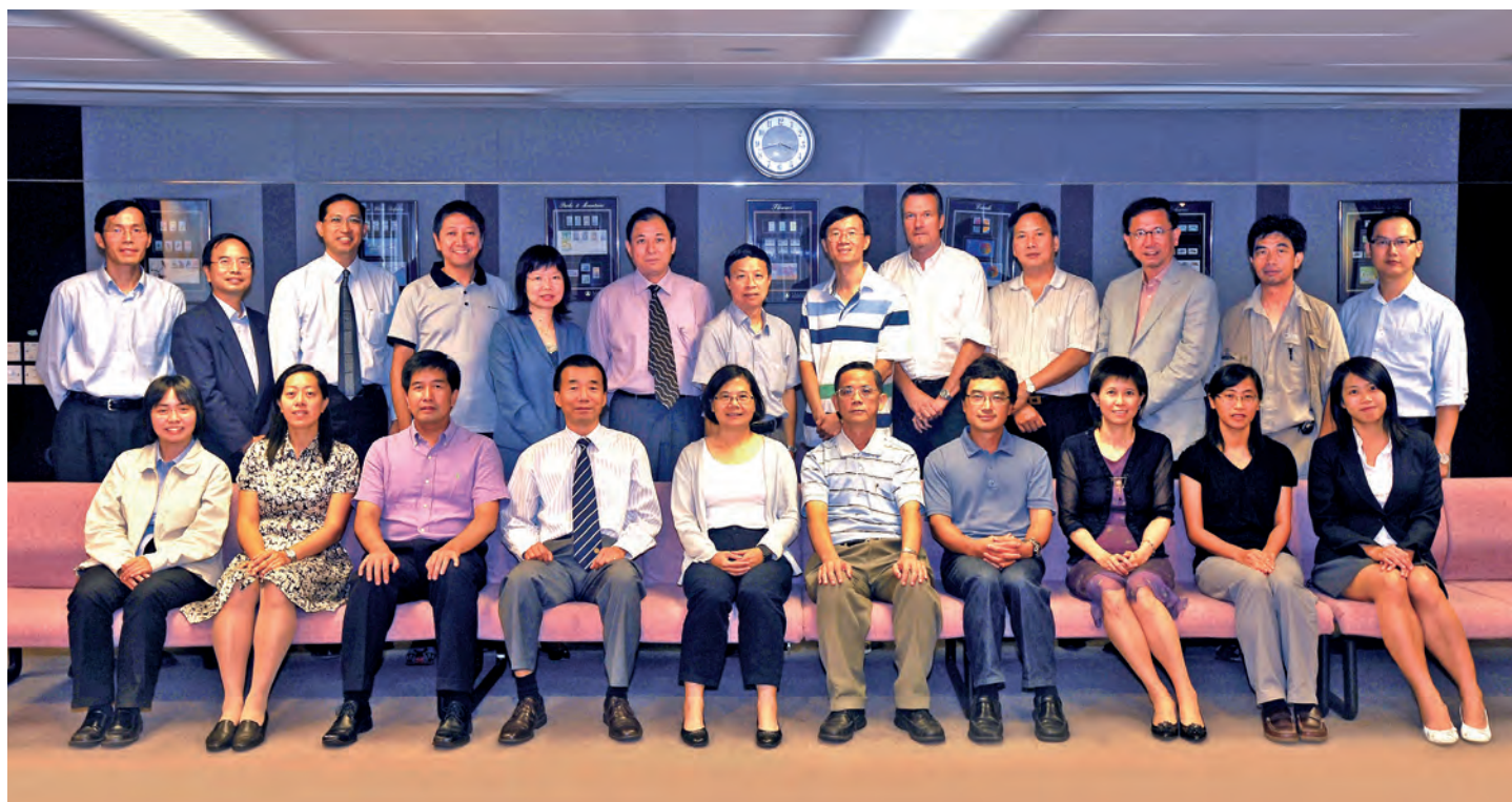
郊野公園委員會的委員在二〇〇九年八月六日的會議上合照 Members of the Country Parks Committee at a meeting held on 6 August 2009