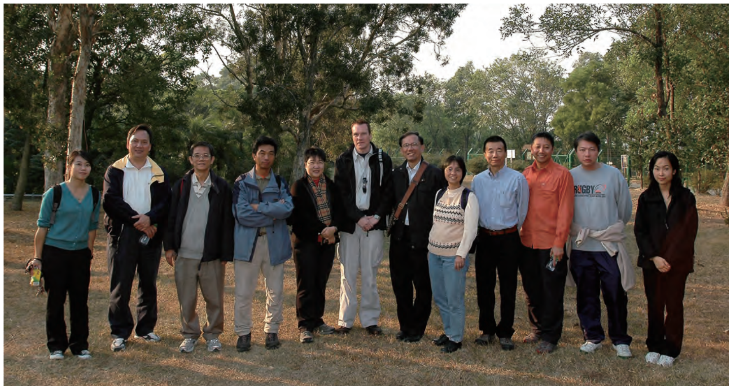
郊野公園及海岸公園委員會的委員在二〇〇八年十二月十一日的考察活動中合照 Members of the Country and Marine Parks Board during a Field Visit held on 11 December 2008