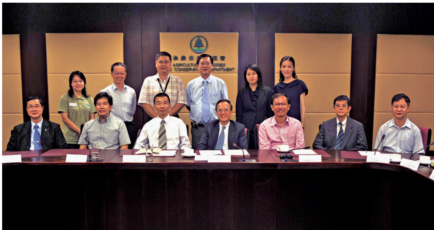
公共關係委員會的委員在二〇〇九年六月二十六日的會議上合照 Members of the Public Relations Committee at a meeting held on 26 June 2009