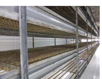
Rack facilities inside the CE cultivation room