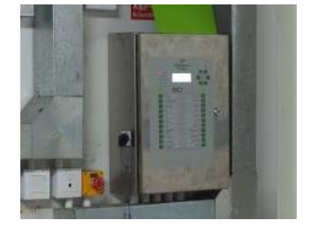
Display panels outside the mushroom cultivation room showing different indices and the operation of facilities