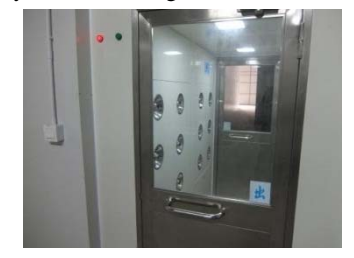
Air shower room