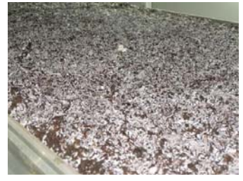
Growth stage of pin-heads