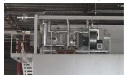
Air cooling and filtering facilities

This mushroom farm looks like the aforementioned one, and one may view it as a factory or a warehouse from a distance, but larger in scale. There are 10 mushroom cultivation rooms in the farm. The environment of the rooms can be separately adjusted and controlled to meet the needs of different species or growth stages of mushrooms. Furthermore, very strict hygiene requirements have been imposed in the farm that everyone has to be disinfected and put on shoe covers before entering the production zone. As told by the operator, though only some of the cultivation rooms are currently in production, the average daily output has already reached 800 kg.