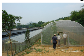
Newly constructed greenhouse

Crops like cucumbers, rock melons and silky gourds are grown in newly constructed greenhouses on a trial basis. Pig pens will be remodelled to make way for larger cultivation area.