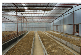
Planting troughs in a greenhouse

A great variety of crops like cucumbers, rock melons, water melons and strawberries are successfully grown by a pig farmer in his greenhouse.