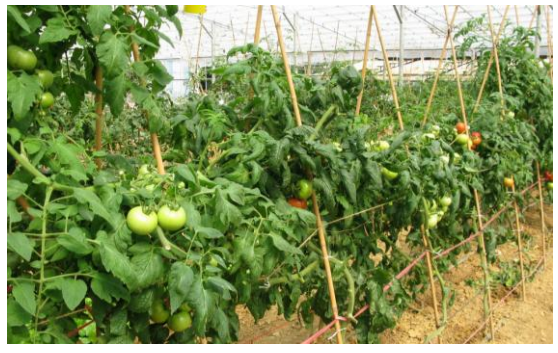
Tomato plants in the greenhouse