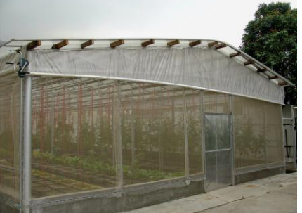
The pig farm was converted into a number of small greenhouses for crop cultivation to facilitate efficient management and production.