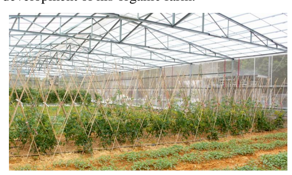
Soil for cultivation