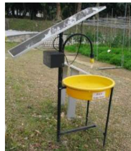
16. Insect attraction lamp To attract insect pests for monitoring and control of pest situation.