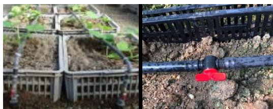
18. Parts and materials for irrigation system For setting up irrigation system.