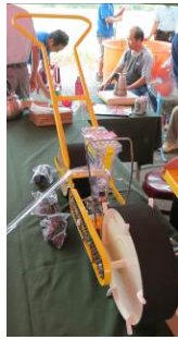
13. Planter For precise seeding directly onto the soil bed.