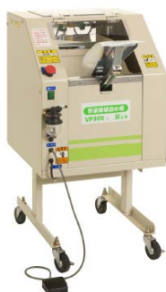
17. Vegetable packaging machine For packaging harvested vegetables.