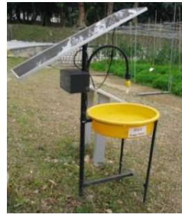
16. Insect attraction lamp To attract insect pests for monitoring and control of pest situation.