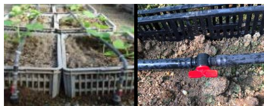
18. Parts and materials for irrigation system For setting up irrigation system.