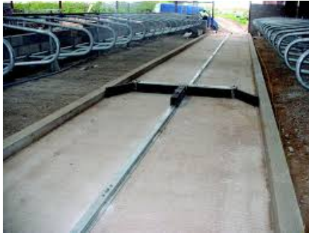
27. Automatic Scraper System For removal of livestock waste automatically.