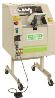
17. Vegetable packaging machine For packaging harvested vegetables.