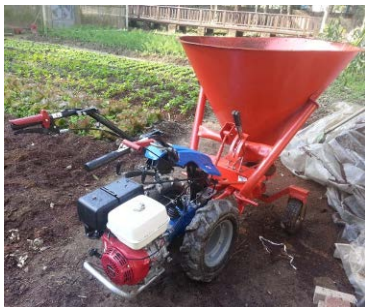
11. Fertiliser/Compost spreader

For spraying liquid fertilisers or liquid pesticides onto plants.