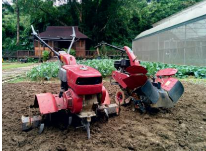
1. Cultivator tiller