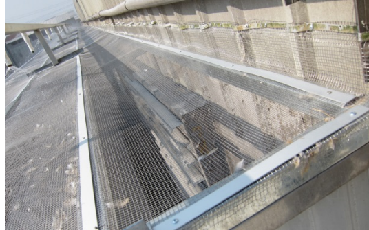
26. Water Spraying system For avoiding feather blowing out from rearing sheds by the exhaust fans.