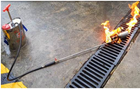
7. Weed burner

To burn weed, kill underground insect pests and reduce soil-borne plant pathogen population.