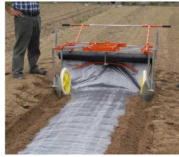
8. Mulch layer

To burn weed, kill underground insect pests and reduce soil-borne plant pathogen population.