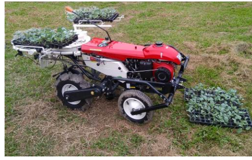
14. Transplanter For transplanting young Seedlings onto the soil bed.