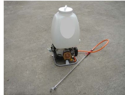
10. Motorised sprayer

To loosen top soil and weeding between rows of planted crops.