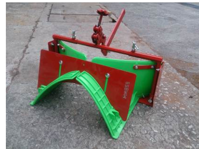
4. Bed shaper

To attach behind a tiller or rotavator for gathering and heaping up the loose soil against young plants planted in rows.