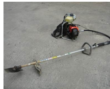
6. Brush cutter

To break new ground, building raised bed and creating drainage ditches on harden soil when powered by a tractor.