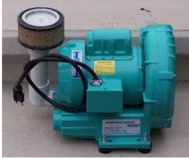
25. Waste Treatment Tank Aeration Blower For use in waste treatment tank in livestock farm.