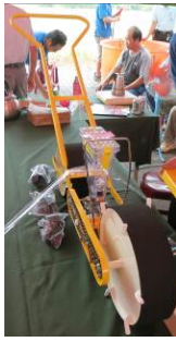
13. Planter For precise seeding directly onto the soil bed.