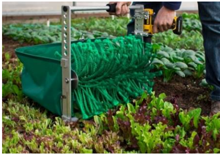
15. Handheld harvester For harvesting crops.