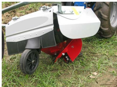
5. Rotary plow

To attach behind a tiller or rotavator for forming the shape of the raised soil bed on loosen soil for cultivation.