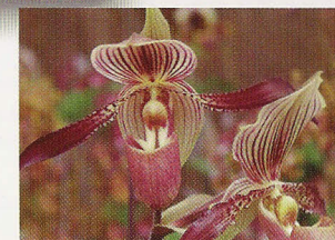
拖鞋蘭 Slipper orchid