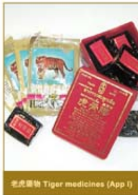
老虎藥物 Tiger medicines (App I)

- The import, export, re-export or possession of herbal medicines or proprietary medicines derived from Appendix I species of wild origin (e.g. tiger bone and rhino horn) requires a licence issued in advance by this Department. However, the commercial trade in these species is banned and this Department will not issue a licence.