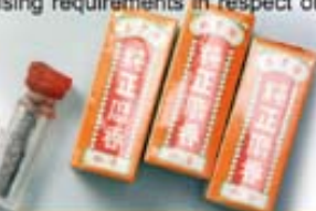
麝香及粉末 Musk pod and grain (App I/II)

- Some species are listed in both Appendices I & II. Herbal medicines or proprietary medicines derived from these species (such as musk or bear gall bladder) are deemed as Appendix I products unless there is evidence showing that they are not originated from Appendix I species (e.g. the medicines are accompanied with CITES export permit showing that the species therein are listed in Appendix II).