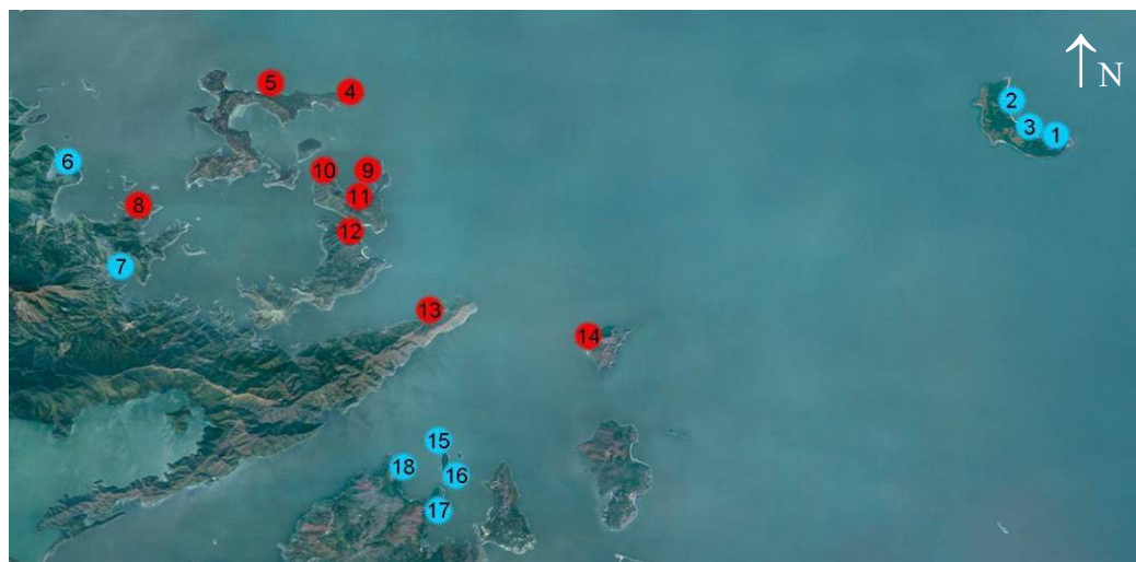
Figure 1 Reef Check site location & hard coral coverage comparison (2018 vs 2019)