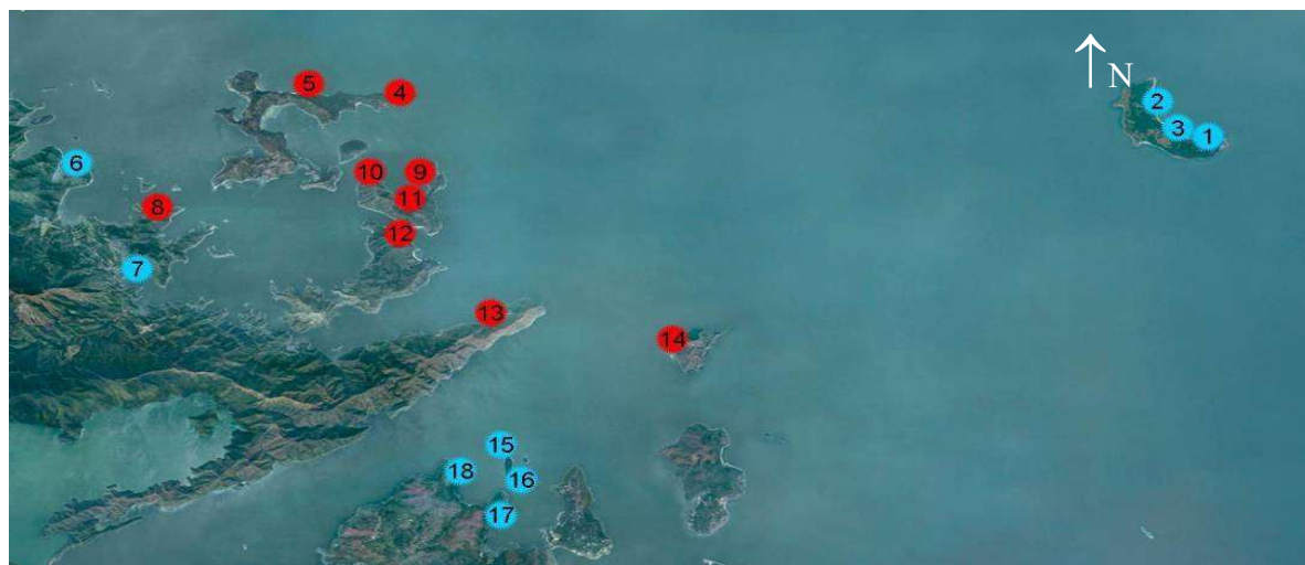
Figure 1 Reef Check site location & hard coral coverage comparison (2021 vs 2022)