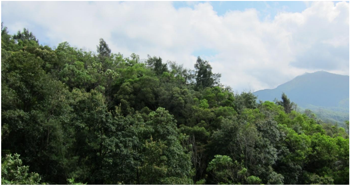
Site photo 1 : General view