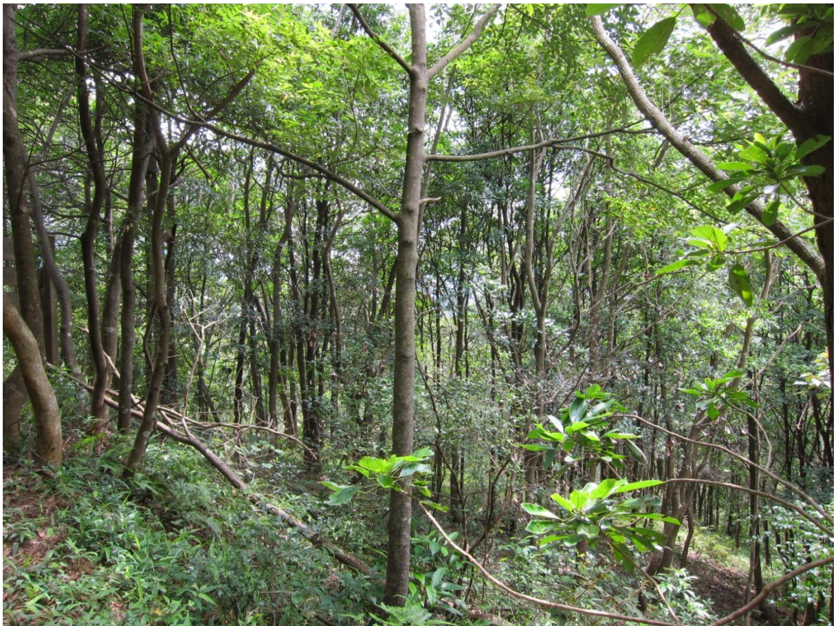
Site photo 2 : The plantation site