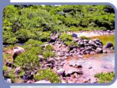
攔路坳 Lan Lo Au