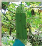
真瓜加黏紙 A bitter gourd with sticky papers