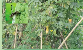
苦瓜 Bitter gourd

Melon flies in Hong Kong consist mainly of Bactrocera tau and Bactrocera cucurbitae . The female flies lay eggs into a melon fruit which later becomes rotten. All common gourd crops, such as pumpkin, hairy gourd, bitter gourd, cucumber, wax gourd and chayote are their hosts. They fly a long distance, reproduce fast and have invaded vast area of the world.