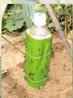
水樽加黏紙 A bottle with sticky papers

Sticky trap - we use green or yellow sticky papers to wrap a bottle, and then hang the bottle near a melon fruit. Flies are deceived by the shape and captured when they touch the sticky paper.