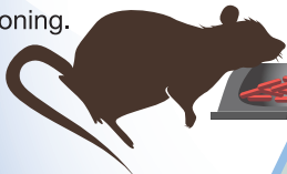
老鼠藥餌 Rat Bait 施放日期 application date

Baits should be placed in locations inaccessible to children and pets to avoid accidental contact or poisoning.