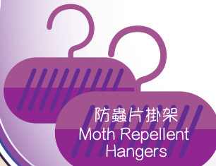
防蟲片掛架 Moth Repellent Hangers

應避免長期接近及吸入釋出的氣體。 Avoid prolonged exposure to and inhalation of released vapour.