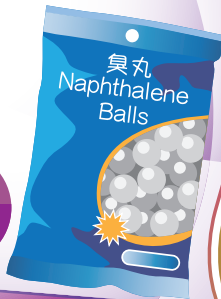
臭丸 Naphthalene Balls