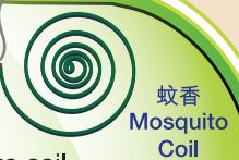
蚊香 Mosquito Coil