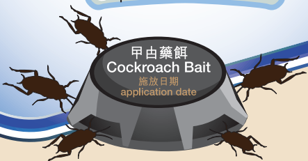
甲由藥餌 Cockroach Bait 施放日期 application date

應在藥餌盒寫上施放日期，以便日後依時更換。 Application date should be written on the bait station to facilitate its replacement.