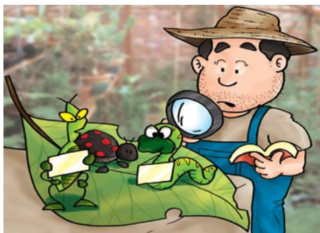
鑑別、監察及評估蟲害情況。 Identification, monitoring and assessment of pest problems.