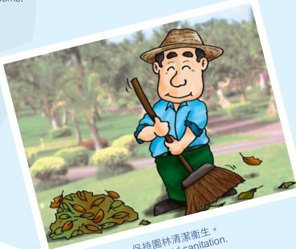
保持園林清潔衛生。 Good field sanitation.