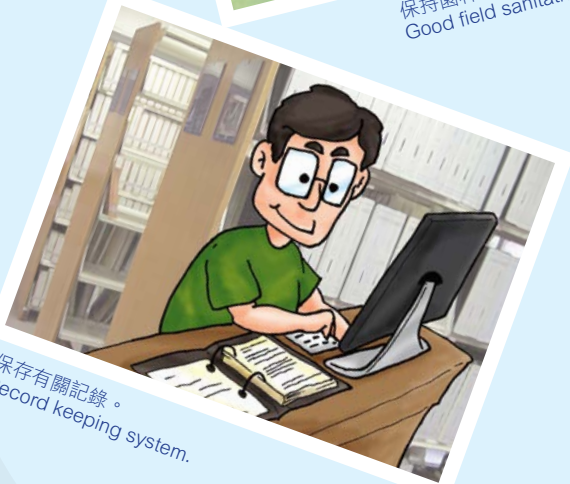
保存有關記錄。 Record keeping system.