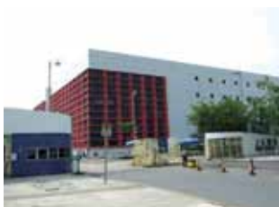
(2) Slaughterhouse