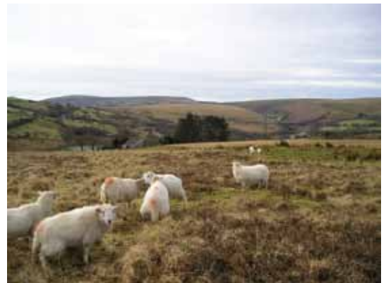
Welsh sheep on uplands: currently some sheep grazing uplands are under restriction while measurements are taken, this has been continuing for over 25 years.

Sheep from affected areas are still scanned before entering the food chain. In the weeks and months following the accident, more than 5,000 farms were placed under restrictions. Over the years, this number has come down to the current 330 in Wales and 8 in Cumbria, England.