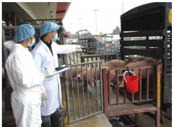
A government vet performing ante-mortem inspection on live pigs being unloaded at the Sheung Shui Slaughterhouse in Hong Kong

For example, the United States Department of Agriculture (USDA) requires that a vet be on site at a slaughterhouse at all working times and that personnel handling, herding, stunning, moving, transporting, or otherwise