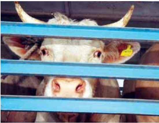
Cattle available for inspection during transport

As defined by the Encyclopedia Britannica; “ante-mortem inspection (宰前檢驗) identifies animals not fit for human consumption. Here animals that are down, disabled, diseased, or dead are removed from the food chain and labeled “condemned.” Other animals showing signs of being sick are labeled “suspect” and are segregated from healthy animals for more thorough inspection during processing procedures. Post-mortem inspection (宰後檢驗) of the head, viscera, and carcasses helps to identify whole carcasses, individual parts, or organs that are not wholesome or safe for human consumption.”