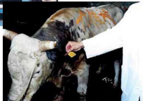
An animal traceback exercise in Hong Kong

The aim of the traceback exercise is to find out where in the chain the problem has occurred. Did the problem occur at the point of sale in for example a restaurant? If not then did the problem occur at a food storage point? If so, which one and what other foods were stored at the time and at that place? Alternatively, did the problem occur at a processing plant and if so, which one? This is highly relevant for example with ground beef and E. Coli O157 food poisoning. If not these ones, did the problem occur at a food factory? Which one and on what day? What other batches of food from that factory may be affected? If not the food factory, how about the abattoir? If not the abattoir, the livestock transport lorries to the abattoir or finally the farm itself or the feed going into the farm. In this whole traceback process, many professions will be involved not only vets (See the first box on page 1), but if the source looks increasingly likely to be from the farm itself, there is a much greater veterinary involvement compared to other professions.