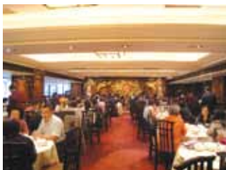
(5) Restaurant

From farm to fork through slaughterhouse, processing and transport.