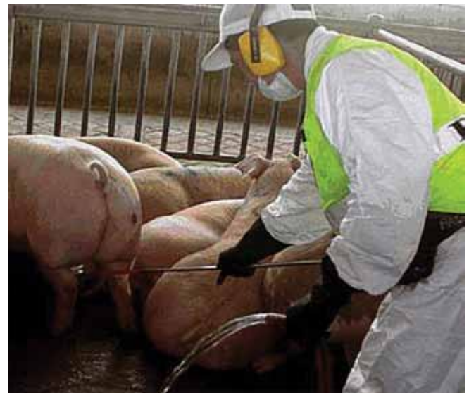
Clenbuterol residue checking in a Hong Kong slaughterhouse

The picture on the right shows an inspector collecting the urine of a pig that may contain traces of an illegal substance, such as Clenbuterol (鹽酸克倫特羅) or Salbutamol (沙丁胺醇).