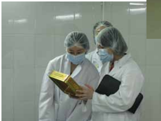
Veterinary inspection of moon cake factory

At the beginning of this issue, you were asked to consider what word you would associate with vet. It was likely you associated it with dogs, cats, and their health. Now you may perhaps consider associating many foods with the word vet. For hopefully in one sense much of the food you will eat in the future will have been “vetted”. That is to say it will have been thoroughly checked by a vet.