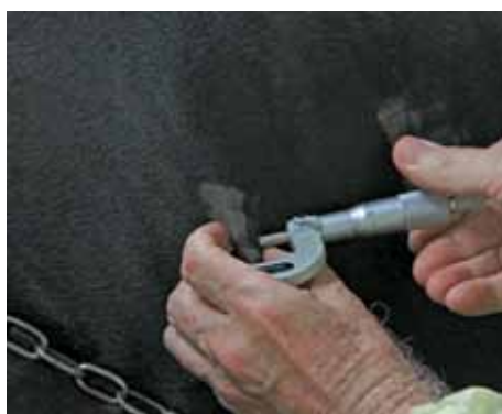
Testing of a dairy cow for Tuberculosis

In the picture below, local chickens about to be marketed are being bled to check for the absence of the zoonotic avian influenza H5N1 infection; this is very much a vet directed process.