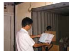
(4) Transport of product after inspection