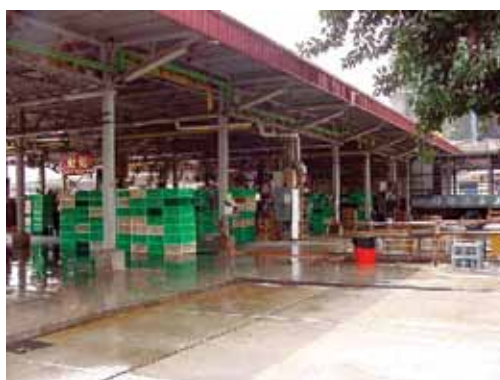
Rest Day and Cleansing of a Hong Kong Wholesale Poultry Market

A related example is the European practice found in the UK, where government vets routinely inspect livestock auction markets and where animal health officers (AHO), under their direction, are stationed at the auction usually for the whole day of the market. If an AHO detects a problem that requires professional attention; he will call a government vet or private vet to attend to the case.