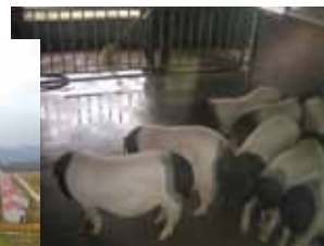
(1) Pig farm