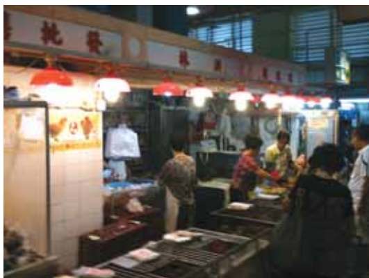
Poultry market in Hong Kong