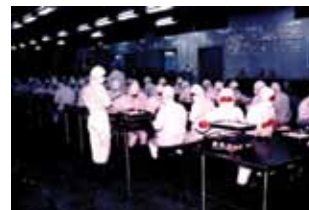
(3) Food processing factory