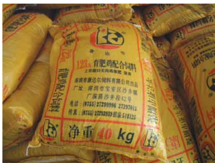
Animal feeds for chicken available for inspection

In these cases, if there is a problem, the vet will try to find and remove the source of the toxin. Checks will be made for a period on the animals, their milk, meat, eggs etc., to make sure that the level of the toxin present is below international safety standards.