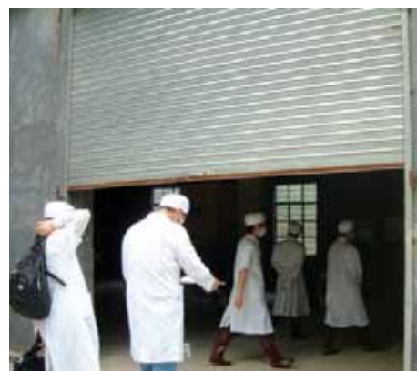
Officials entering animal feed store for inspection

Dioxins, heavy metals such as lead and mercury, polychlorinated biphenyls (PCBs), dichlorodiphenyltrichloroethane (DDT) (滴滴涕) radionuclides (radioactivity), salmonella, and the prion (朊毒體) causing bovine spongiform encephalopathy (BSE) are well known examples of contamination in animal feed.