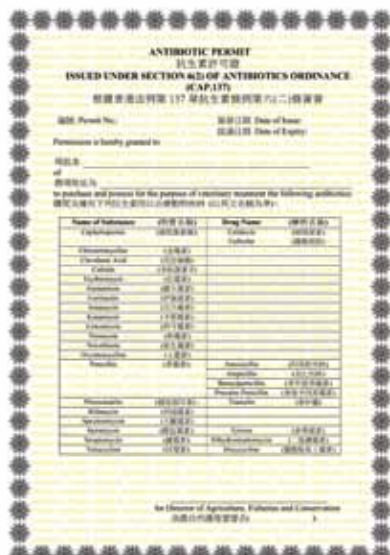
Antibiotic Permit issued to farmers

Furthermore, they will be advising the farmer to ensure that he has records of what drugs he uses on the farm and which individual animals receive these drugs. One of the most important reasons for this is to ensure that any animal, which is sent to slaughter, has drug residues below the permitted limit before it is slaughtered. This period is known as the "withdrawal period (停藥期)". Withdrawal periods are typically around two to three weeks. However, for some drugs the withdrawal period can be as short as 12 hours and for others as long as many months.