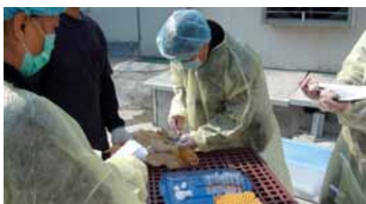
Bleeding a chicken for H5N1 testing in Hong Kong

In the picture below, local chickens about to be marketed are being bled to check for the absence of the zoonotic avian influenza H5N1 infection; this is very much a vet directed process.