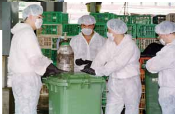
Poultry market closure and cull after the discovery of H5N1 in Hong Kong