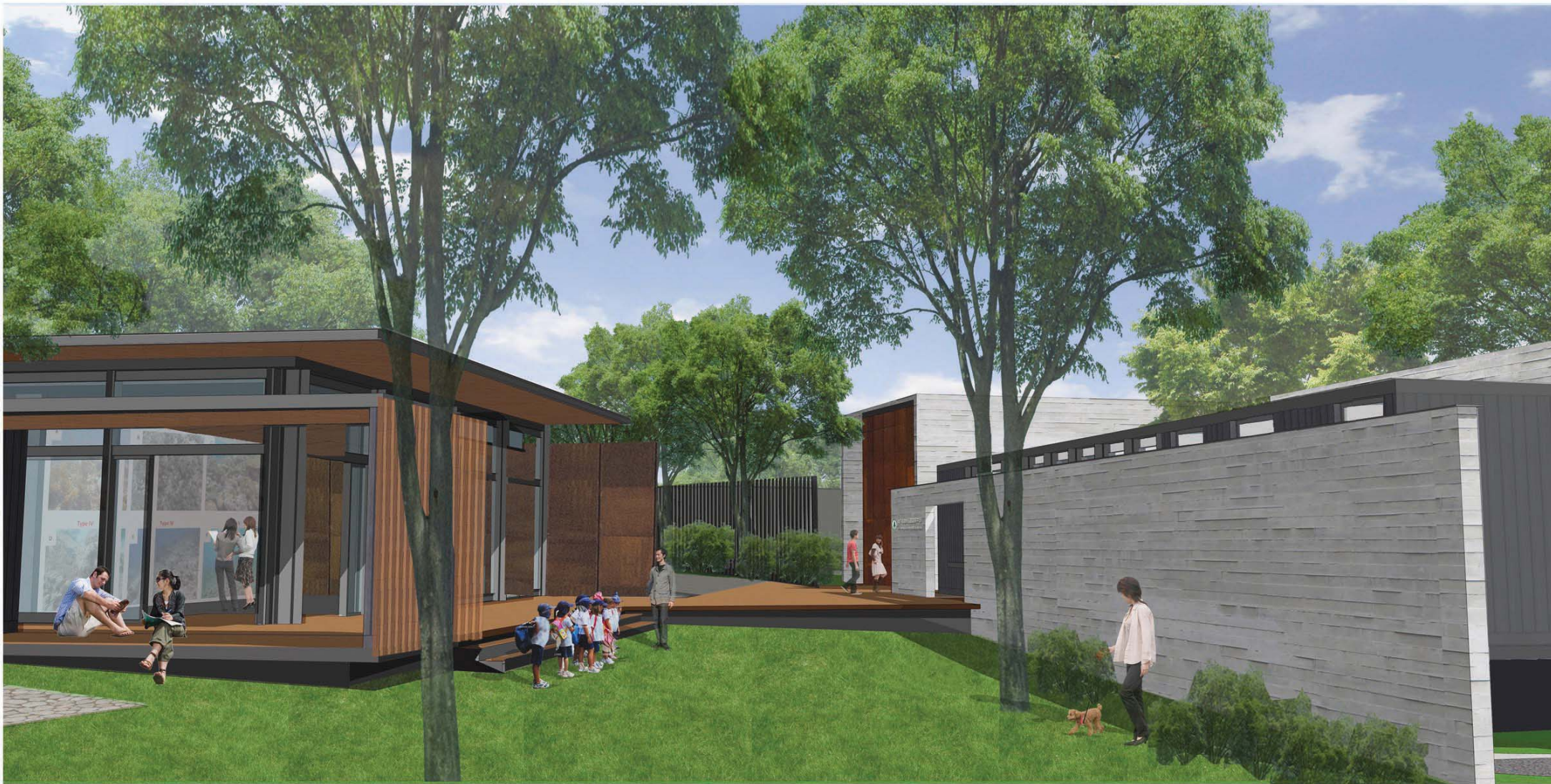
海下灣海岸公園遊客中心的構想圖 Artist's Impression of the Hoi Ha Wan Marine Park Visitor Centre