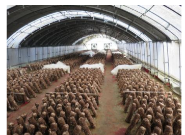
Large exhaust fan