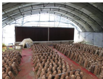
Water curtain for cooling the temperature

A local farmer has adopted CE technologies to produce fresh shiitake mushrooms. The mycelium-filled compost bags imported from the Mainland are cylindrical in shape, which look like wooden pillars. The temperature and illumination in the greenhouse of the farm are regulated by using water curtain, exhaust fans, spraying equipment and black plastic diaphragm to cover the rooftop. The fresh shiitake mushrooms are now available through direct sale or in supermarkets.