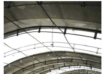
Spraying equipment hanging over the rooftop