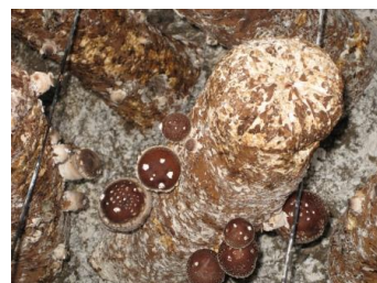
Growing shiitake mushroom