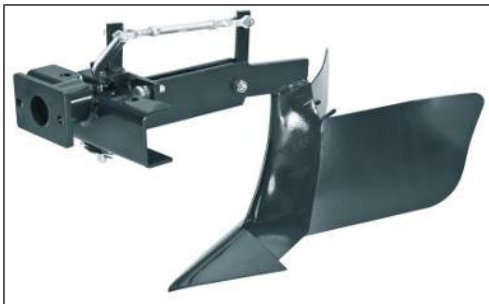
3. Ridger attachment To attach behind a tiller or rotavator for gathering and heaping up the loose soil against young plants planted in rows.