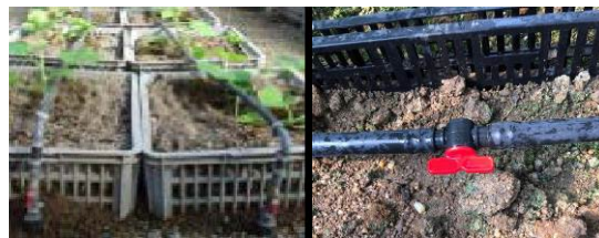
18. Parts and materials for irrigation system For setting up irrigation system.