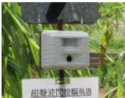
29. Bird Repeller For driving wild birds away and preventing birds from damaging crops.