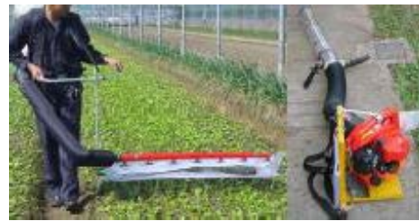
28. Insect Suction Trap Catcher For trapping tiny pests.