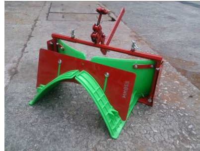
4. Bed shaper To attach behind a tiller or rotavator for forming the shape of the raised soil bed on loosen soil for cultivation.