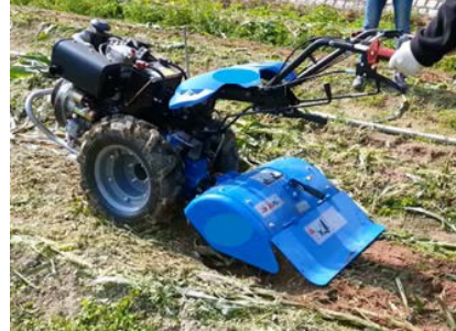
2. Tractor mounted rotavator To break up compact soil into smaller pieces before cultivation.