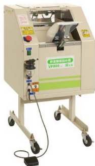
17. Vegetable packaging machine For packaging harvested vegetables.