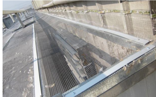
26. Water Spraying system For avoiding feather blowing out from rearing sheds by the exhaust fans.