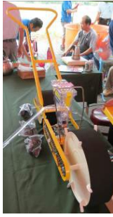
13. Planter For precise seeding directly onto the soil bed.