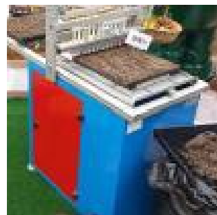
30. Nursery Seedler For sowing seeds in seedling trays.