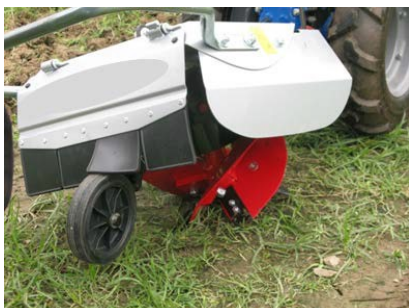
5. Rotary plow To break new ground, building raised bed and creating drainage ditches on harden soil when powered by a tractor.