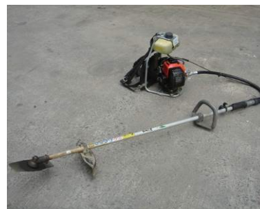
6. Brush cutter To clear grass, small bushes and undergrowth.