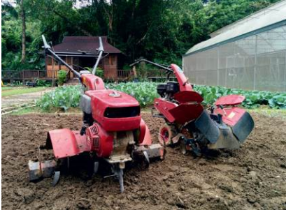
1. Cultivator tiller To loosen top soil before cultivation.