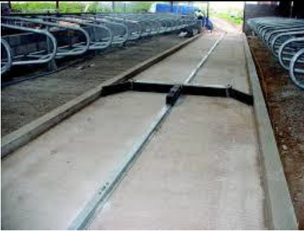
27. Automatic Scraper System For removal of livestock waste automatically.