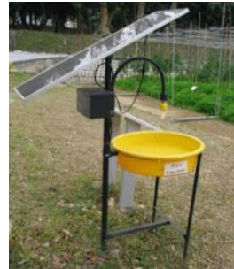
16. Insect attraction lamp To attract insect pests for monitoring and control of pest situation.