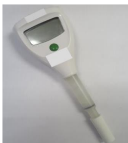
41. Soil pH tester For rapid determination of soil pH values.