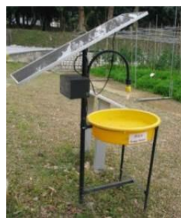
16. Insect attraction lamp To attract insect pests for monitoring and control of pest situation.