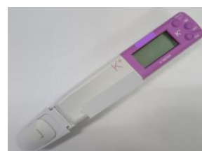
44. Potassium ion meter For rapid determination of potassium ion concentration in samples.