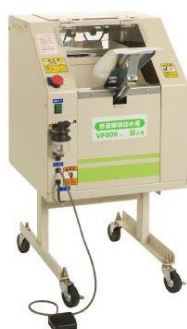
17. Vegetable packaging machine For packaging harvested vegetables.