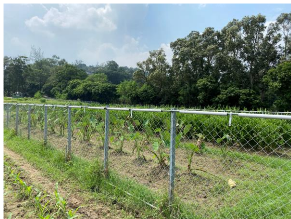
40. Fences for wild pigs Erecting fences to protect farms from wild pig nuisance.