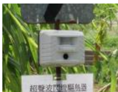
29. Bird Repeller For driving wild birds away and preventing birds from damaging crops.