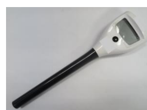
42. Soil EC tester For rapid determination of soil electrical conductivity (EC).