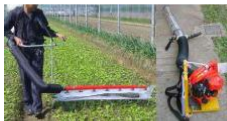
28. Insect Suction Trap Catcher For trapping tiny pests.