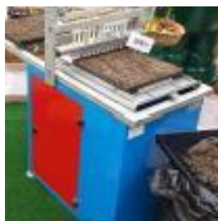
30. Nursery Seedler For sowing seeds in seedling trays.