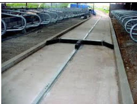
27. Automatic Scraper System For removal of livestock waste automatically.