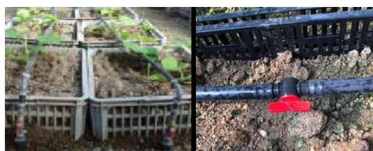
18. Parts and materials for irrigation system For setting up irrigation system.