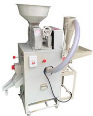
39. Paddy processing equipment For post-harvest processing of paddy.