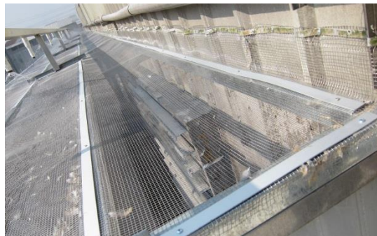
26. Water Spraying system For avoiding feather blowing out from rearing sheds by the exhaust fans.