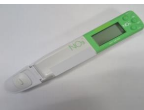
43. Nitrate ion meter For rapid determination of nitrate ion concentration in samples.