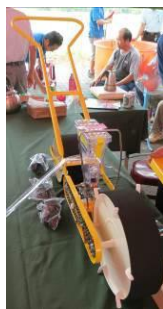
13. Planter For precise seeding directly onto the soil bed.