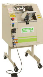
17. Vegetable packaging machine For packaging harvested vegetables.