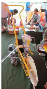
13. Planter For precise seeding directly onto the soil bed.