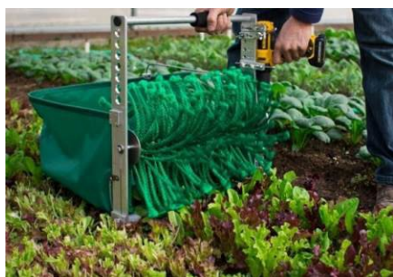
15. Handheld harvester For harvesting crops.