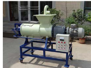
24. Solid Liquid Waste Separator For separation of solids from livestock waste to improve treatment efficiency.