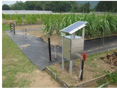
20. Electric fence

For erecting simple protective structure to protect crops from heavy rain and/or pests.