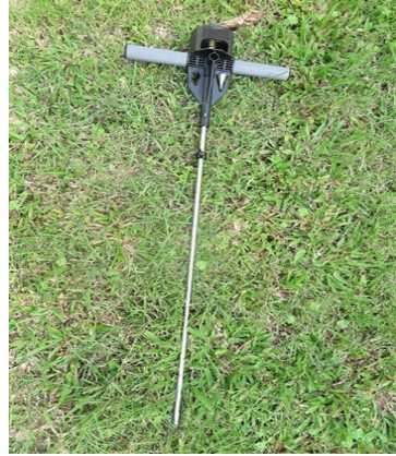
46. Soil compaction tester For measurement of soil compaction level