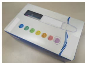
43. Nitrate ion meter For rapid determination of nitrate ion concentration in samples.