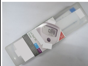
42. Soil EC tester For rapid determination of soil electrical conductivity (EC).