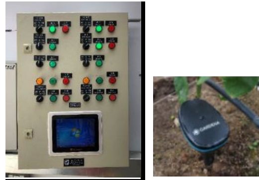
48. Remote monitoring and control systems for farms For remote monitoring of the farm environment and control of various equipment.