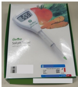
41. Soil pH tester For rapid determination of soil pH values.