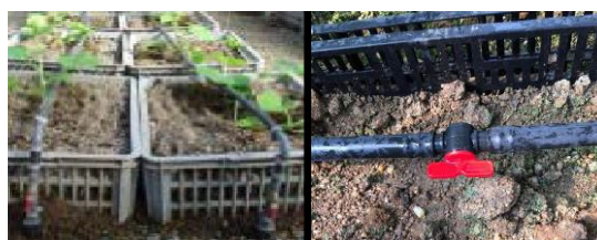
18. Parts and materials for irrigation system For setting up irrigation system.