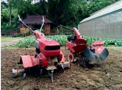
1. Cultivator tiller