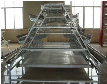
23. Belt Manure Removal System For removal of livestock waste automatically.