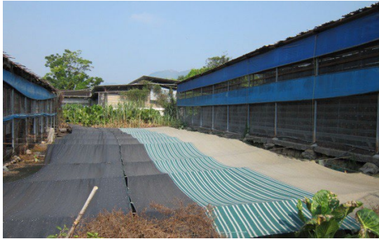
21. Covers for waste treatment facilities To reduce odour.

For preventing wild animals from damaging crops.