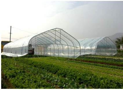
19. Parts and materials for protective structure

For erecting simple protective structure to protect crops from heavy rain and/or pests.