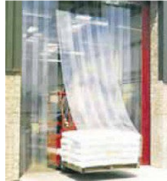
22. Bird Entrance Barrier Plastic strip curtains or chain link doors for preventing entry of birds into rearing sheds.