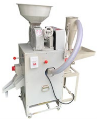
39. Paddy processing equipment For post-harvest processing of paddy.