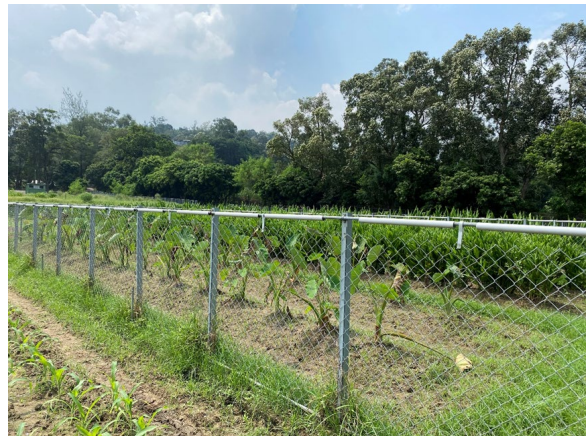
40. Fences for wild pigs Erecting fences to protect farms from wild pig nuisance.