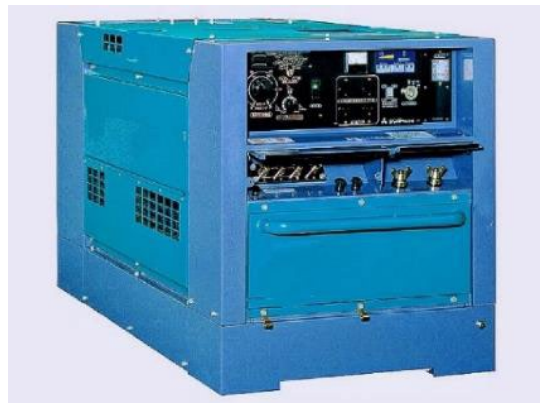
50. Backup generator To provide emergency electricity supply for maintaining normal farm operation in case of power outage.