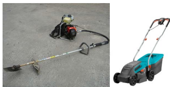
6. Brush cutter

To break new ground, building raised bed and creating drainage ditches on harden soil when powered by a tractor.