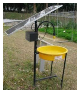
16. Insect attraction lamp To attract insect pests for monitoring and control of pest situation.