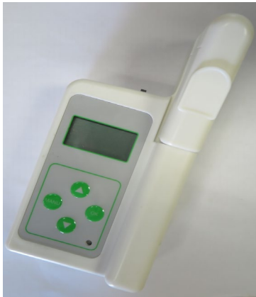
47. Chlorophyll meter For non-invasive measurement of chlorophyll content, leaf surface temperature and moisture content of plants.