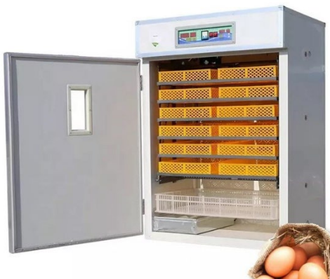
49. Egg incubator To simulate a natural incubation environment for large scale production of day-old-chicks by controlling various factors (such as temperature, humidity, ventilation) through a fully-automated computer system.