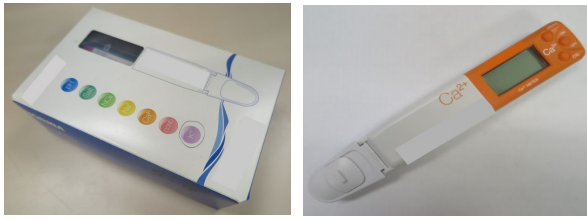
45. Calcium ion meter For rapid determination of calcium ion concentration in samples.