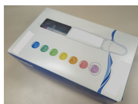
44. Potassium ion meter For rapid determination of potassium ion concentration in samples.