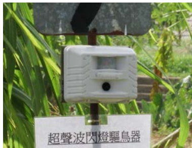
29. Bird repeller For driving wild birds away and preventing birds from damaging crops.