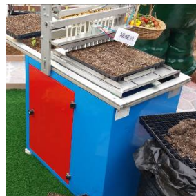
30. Seedling tray planter For sowing seeds in seedling trays.