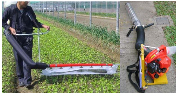
28. Insect suction trap catcher For trapping tiny pests.