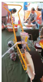
13. Planter For precise seeding directly onto the soil bed.