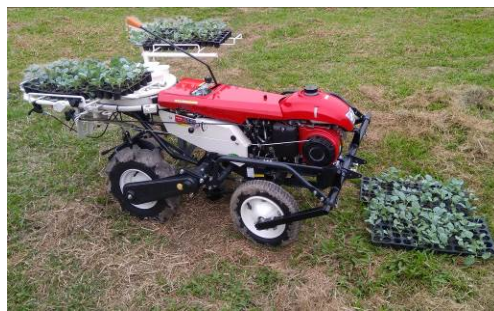
14. Transplanter For transplanting young Seedlings onto the soil bed.