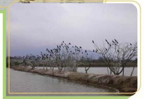
每年秋、冬季均有大量候鳥遷徙至香港越冬 Large amount of birds migrate to Hong Kong during Autumn and Winter