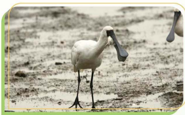
黑臉琵鷺是全球瀕危鳥種 Black-faced Spoonbill is a globally endangered species