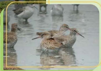
香港濕地公園有多種不同類型的生境，適合不同種類的雀鳥棲息 Hong Kong Wetland Park has a variety of wetland habitats for different types of birds