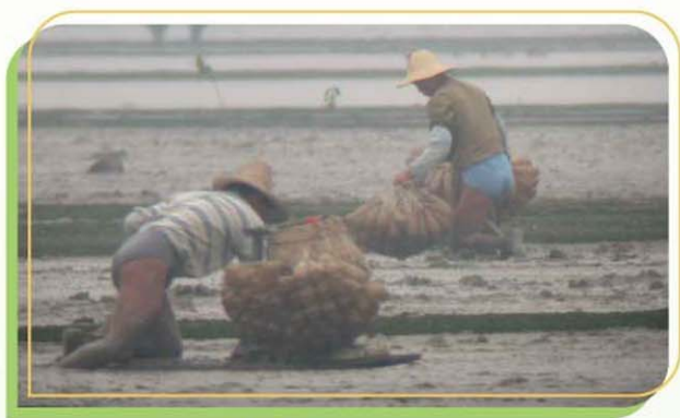
漁民在后海灣捕捉彈塗魚 Fishermen collect mudskippers at Deep Bay area

In addition, the feeding and roosting sites of waterbirds are also disturbed by other human activities such as tourism and mudskipper trapping.