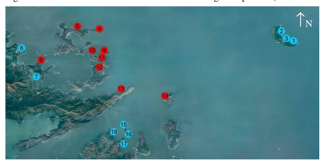
Figure 1 Reef Check site location & hard coral coverage comparison (2013 vs 2014)