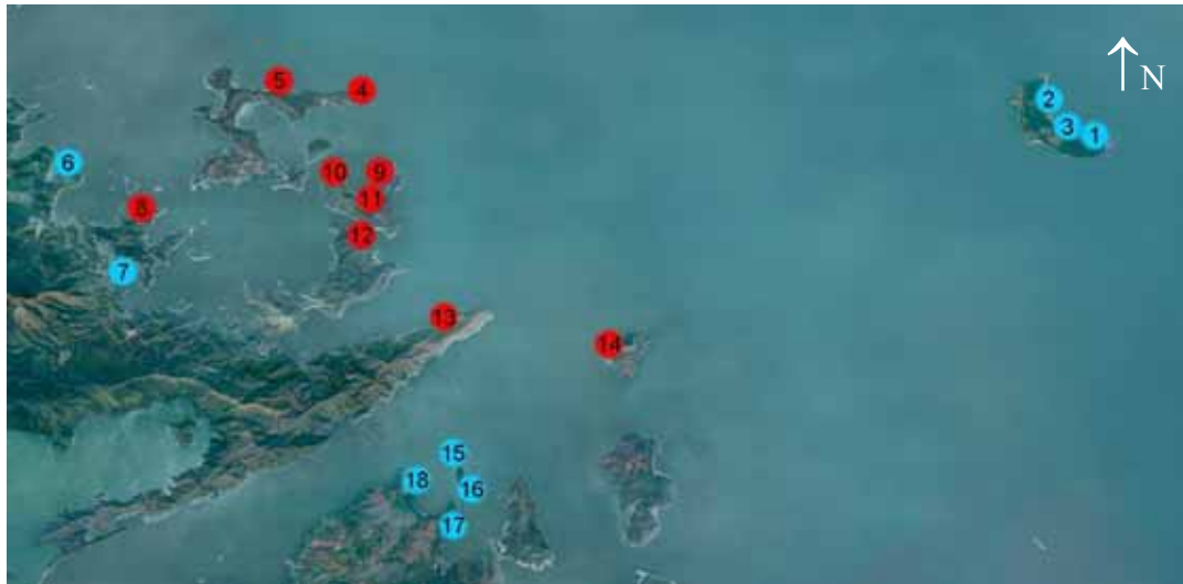
Figure 1 Reef Check site location & hard coral coverage comparison (2008 vs 2009)