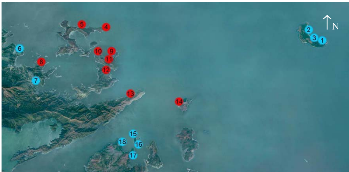
Figure 1 Reef Check site location & hard coral coverage comparison (2010 vs 2011)