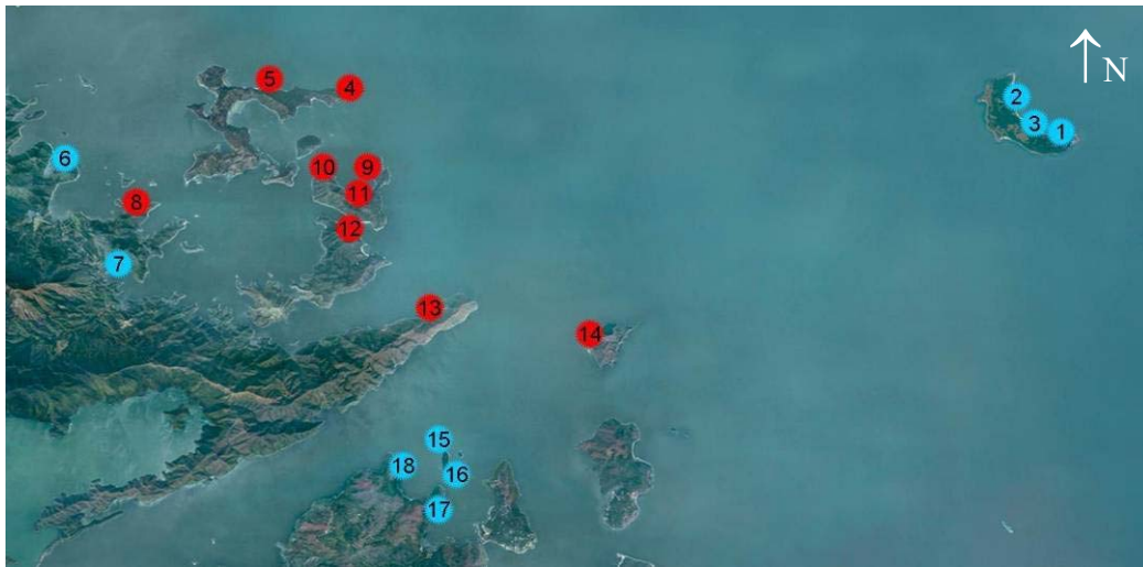
Figure 1 Reef Check site location & hard coral coverage comparison (2019 vs 2020)