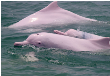
中華白海豚 Chinese White Dolphins

South Lantau Marine Park is situated in the southern Lantau waters, with a total sea area of about 2067 hectares. It was designated as marine park in June 2022, with the aim to help better conserve the Chinese White Dolphins and Finless Porpoises, their habitats and to enhance the fisheries resources therein. The landward boundary generally follows the high water mark along the coastline while excluding the four inner bay areas of Siu A Chau and two inner bay areas of Tai A Chau. The boundary is generally demarcated by yellow lighted buoys at the periphery of the marine park. Please refer to the gazette map and explanatory material for the actual boundary. The maximum speed limit of vessels within the South Lantau Marine Park is 10 knots in accordance with the Marine Parks and Marine Reserves Regulation (Cap. 476A).