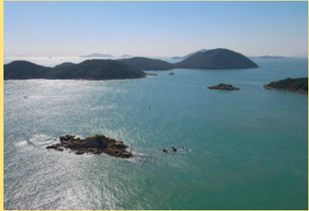
南大嶼海岸公園的核心區 Core area of South Lantau Marine Park