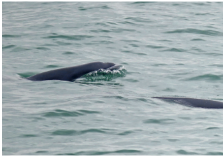
江豚 Finless Porpoises

South Lantau Marine Park is adjacent to the Southwest Lantau Marine Park, located in southern waters of Hong Kong. It serves as an important habitat for Chinese White Dolphins ( Sousa chinensis ) and Finless Porpoises ( Neophocaena phocaenoides ). The fisheries resources of Soko Islands is one of the best within southern Lantau waters, thus it also serves as an important feeding ground of both species.