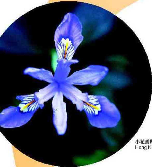
小花鳶尾 Hong Kong Iris