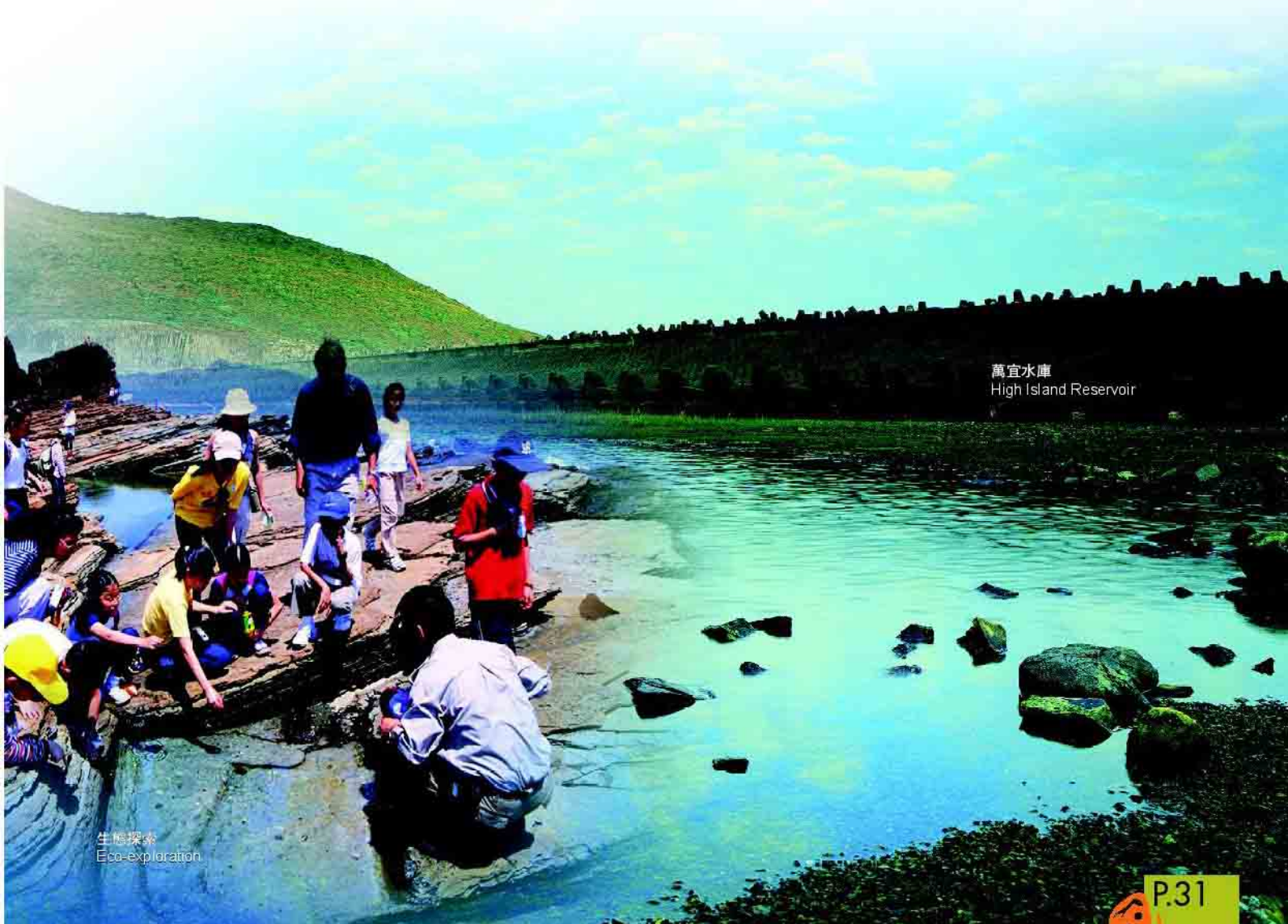
萬宜水庫 High Island Reservoir

4.7 We will take full account of the views received in finalising the way forward.