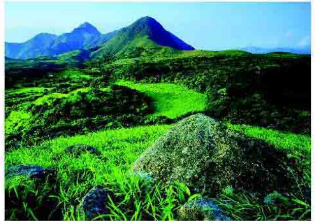
馬鞍山郊野公園 Ma On Shan Country Park

4.5 We are fully aware of the limitations of the existing measures in providing full protection of ecologically important sites that are under private ownership, and the potential controversy as it involves how the balance should be struck between the right of the landowners on the use of their land on one hand and the right and desire of the community to protect the natural asset and to enjoy a pleasant natural environment on the other hand. Identifying practicable measures to better conserve these sites is a highly controversial and complex issue involving many different stakeholders and diverse considerations including financial implications, cost-effectiveness, land use planning, implementation difficulties, etc. Your views will help us map out a more comprehensive nature conservation policy and measures that will enable us to better achieve our nature conservation objective.