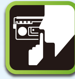
盡量降低聲量 Keep the voice down