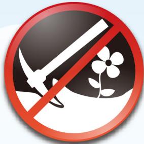
切勿損害任何植物 或擾亂土壤 Don't damage any plant or disturb soil