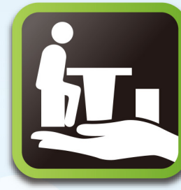
愛護公物 Take good care of public facilities