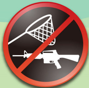
禁止攜帶任何獵捕 或陷阱類器具或槍械 Don't carry any hunting or trapping appliance or arms