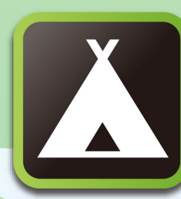
只可在指定露營地點 露營或建立帳幕 Camp or erect a tent only in designated camp sites