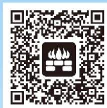
郊野公園指定燒烤地點 Country Parks Designated Barbecue Sites