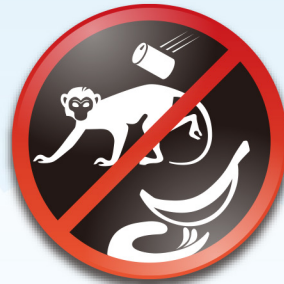
切勿狩獵，傷害或餵飼 任何野生動物 Don't hunt, hurt or feed any wild animal