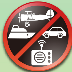
切勿操縱任何動力驅動的模型 飛機、模型車輛或模型船 Don't operate any power driven model aeroplane, model vehicle or model boat