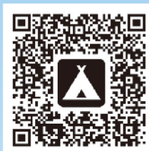
郊野公園指定露營地點 Country Parks Designated Camp Sites