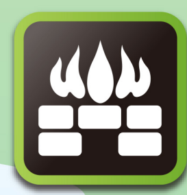
只可在指定燒烤或 露營地點生火 Use fire only in designated barbecue sites or camp sites

以上所列並非盡錄郊野公園及特別地區內受管制的活動。有關詳情，請參閱香港法例第208A章《郊野公園及特別地區規例》、第170章《野生動物保護條例》和第96章《林區及郊區條例》。