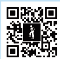
郊野公園遠足安全指引 Country Parks Hiking Safety Guidelines

為他人著想，請不要對其他遊人構成滋擾。經過鄉郊地區時，請尊重村民，切勿損毀私人財產。緊記保持郊野清潔，並將垃圾帶走。