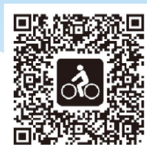
郊野公園越野單車徑或地點 Country Parks Designated Mountain Bike Trails and Sites