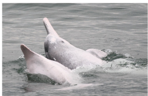
中華白海豚互動中 Chinese White Dolphin socializing

The waters of North Lantau Marine Park, like the nearby Marine Parks, is greatly influenced by the Pearl River freshwater run-off which contains high organic and sediment loading, and is an essential nursery ground for many fish and shellfish species. The western waters of Hong Kong are also important habitat for the Indo-Pacific Humpback Dolphins, locally known as Chinese White Dolphin ( Sousa chinensis ). These waters are spawning grounds for many commercially valuable fish species such as Bartail flathead ( Platycephalus indicus ), Mottled spinefoot ( Siganus fuscescens ) and Belanger's croaker ( Johnius belangerii ) as well as important feeding grounds for Chinese White Dolphins.