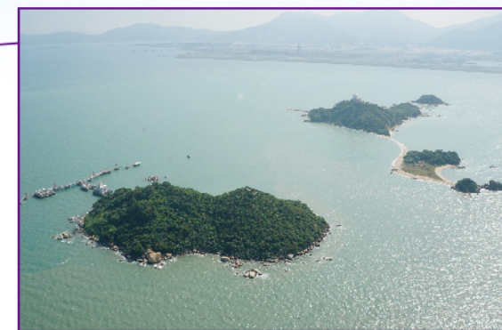
沙洲及龍鼓洲海岸公園（鳥瞰圖） Sha Chau and Lung Kwu Chau Marine Park (bird's-eye view)

Under the marine parks fisheries management strategy, through the marine park fishing permit system, registered local fishing vessels may apply to continue fishing activities in the North Lantau Marine Park. However, fishing activities has been banned at its nearby Sha Chau and Lung Kwu Chau Marine Park (~1,200 ha) and the Core Area of The Brothers Marine Park (~80 ha).