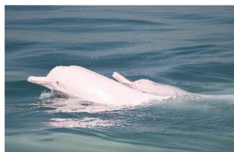
中華白海豚 Chinese White Dolphin ( Sousa chinensis )

North Lantau Marine Park, located in the northern Lantau waters, is the eighth Marine Park in Hong Kong. Designated in November 2024, the total sea area of this marine park is about 2,400 ha in size, North Lantau Marine Park is linked with nearby marine parks for the better conservation of Chinese White Dolphins ( Sousa chinensis ), their habitat, the marine ecology and fisheries resources in the area.