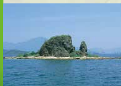
▲ 印洲 Yan Chau

印洲塘有多種地形，例如海灣、突出的陸岬、半島、石崖、沙坑及海灘，並有泥灘、石岸等多類海灘。該處景色優美，一些本地人士更稱它為香港的“小桂林”。