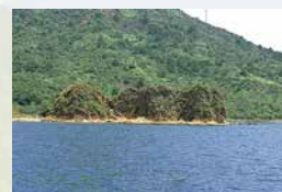
▲ 筆架洲 Pak Ka Chau

印洲塘有多種地形，例如海灣、突出的陸岬、半島、石崖、沙坑及海灘，並有泥灘、石岸等多類海灘。該處景色優美，一些本地人士更稱它為香港的“小桂林”。