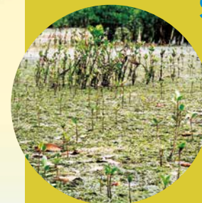
荔枝窩的紅樹林及海草床重疊覆蓋 Seagrass and mangrove overlap in habitat at Lai Chi Wo

SEAGRASS is a marine flowering plant that grows on sandy and muddy substrate. It is important to prevent the loss of coastal sand and mud. Ecologically, seagrass is an important shelter for juvenile and larvae of many fishes and marine invertebrates. It also serves as food for some marine lives such as sea urchin and fishes.