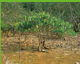
▲ 荔枝窩內的水筆仔 Kandelia obovata at Lai Chi Wo

Two important mangrove areas are located at Lai Chi Wo and Sam A Tsuen within Yan Chau Tong Marine Park. The mangroves site at Sam A Tsuen covers about 3 hectares while those at Lai Chi Wo covers about 2.7 hectares. Seven species of true mangrove plants were recorded in Sam A Tsuen while eight species were recorded at Lai Chi Wo. Mangroves areas are commonly act as nursery grounds for juvenile of fishes and other marine invertebrates.