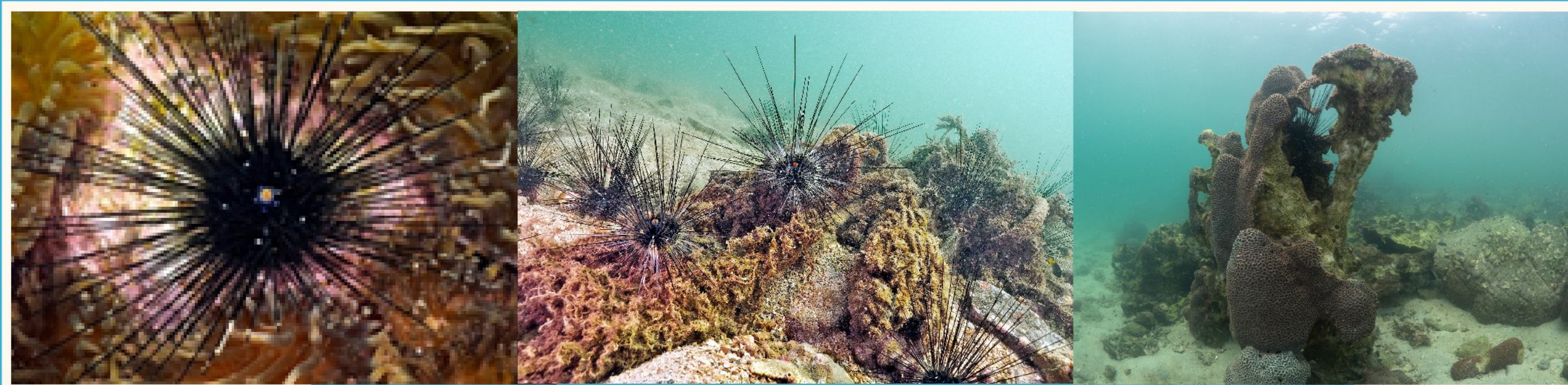
Long-spined sea urchins, Diadema setosum , in Hong Kong waters

However, corals in Hong Kong are facing various threats, including a natural process known as bioerosion. Bioerosion is the degradation of coral skeleton caused by the activities of organisms which drill into the material in search of food or to create a home. In Hong Kong, the major bioeroders include microbes, bivalves, sponges, tubeworms, and sea urchins. Among these bioeroders, the long-spined sea urchin, Diadema setosum (see images below), is often blamed for damaging the reef framework (Dumont et al. , 2013; Lam et al. , 2007). This bioerosion may result in the unusual ‘mushroom’ shape of coral skeleton as the sea urchins erode the base and make them susceptible to collapse (Glynn, 1997).