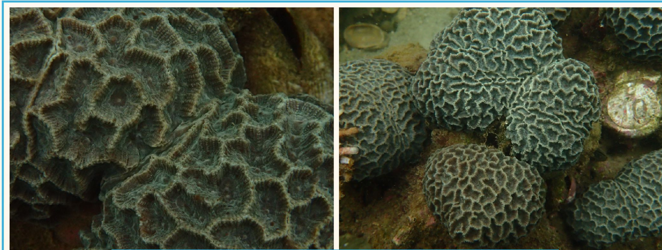
Transplanted coral fragments grew healthily and started to fuse together

After nurturing the fragments for a year, they were then out-planted to pre-selected substrates such as rocks and robust yet dead coral skeleton at suitable water depth. The Project Team has been monitoring the growth and survivorship of the out-planted corals every month since summer 2017. The initial result is encouraging that re-sheeting of live coral tissues over surrounding substrates and fusion of live coral tissues between fragments were observed among the out-planted coral fragments. More results will be presented in the second part of this Featured Story. Stay tuned!