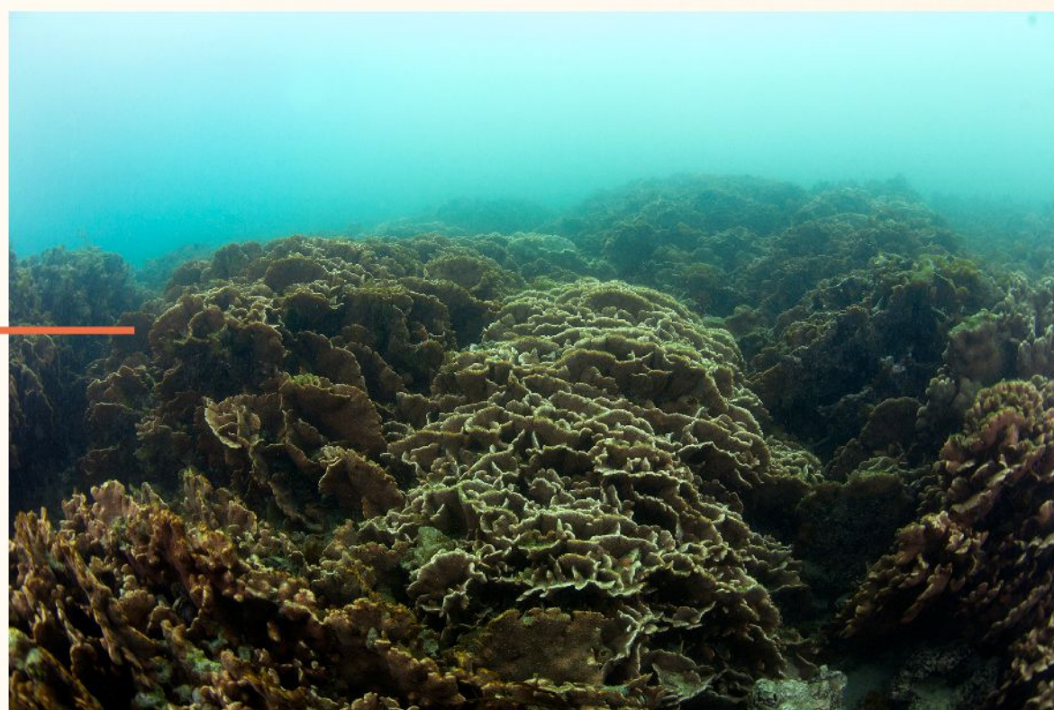
Pavona bed at Coral Beach