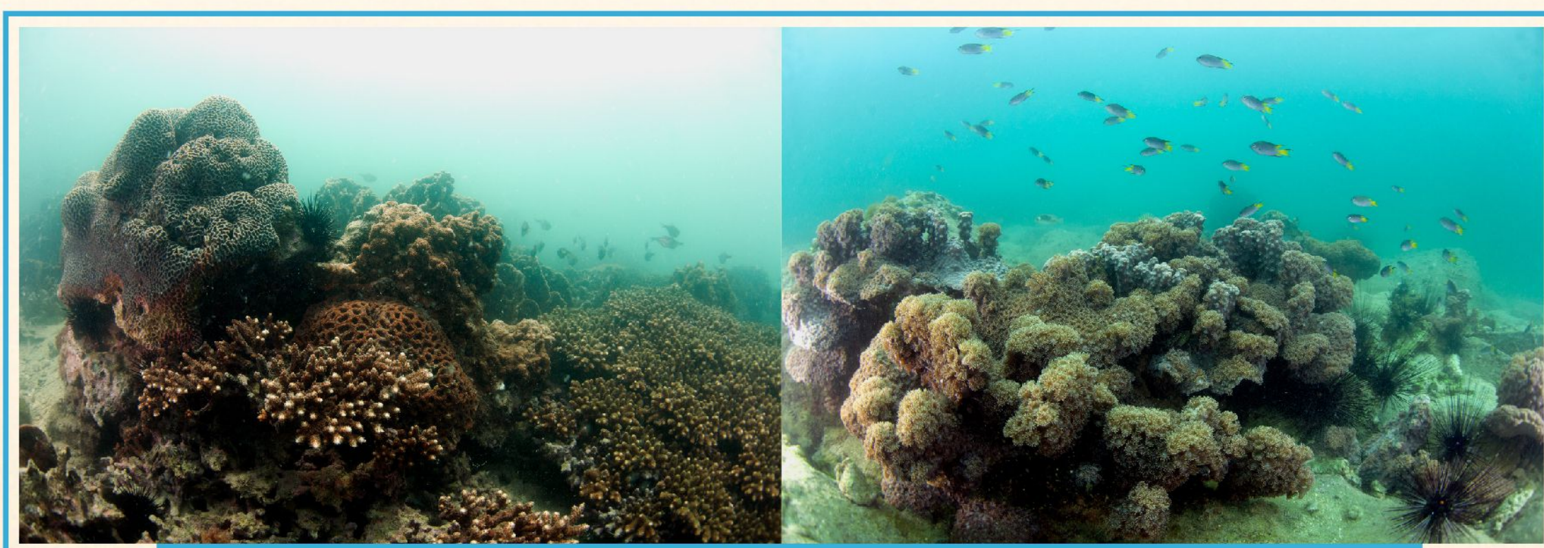
Sea urchins help maintaining balance between coral and algae growth

The competition between coral and algae has been generally seen as the major factor shaping coral reef health. Algae and coral are competitors for limited space on the seafloor. Globally, the increase in algae due to the removal of herbivores has “tipped the balance” against coral growth, health and resilience. While sea urchins are considered bioeroders, they are also herbivores that consume and control the population of algae. Hence, they play an important role in maintaining the health of coral reef by balancing coral-algal competition (Glynn, 1997).