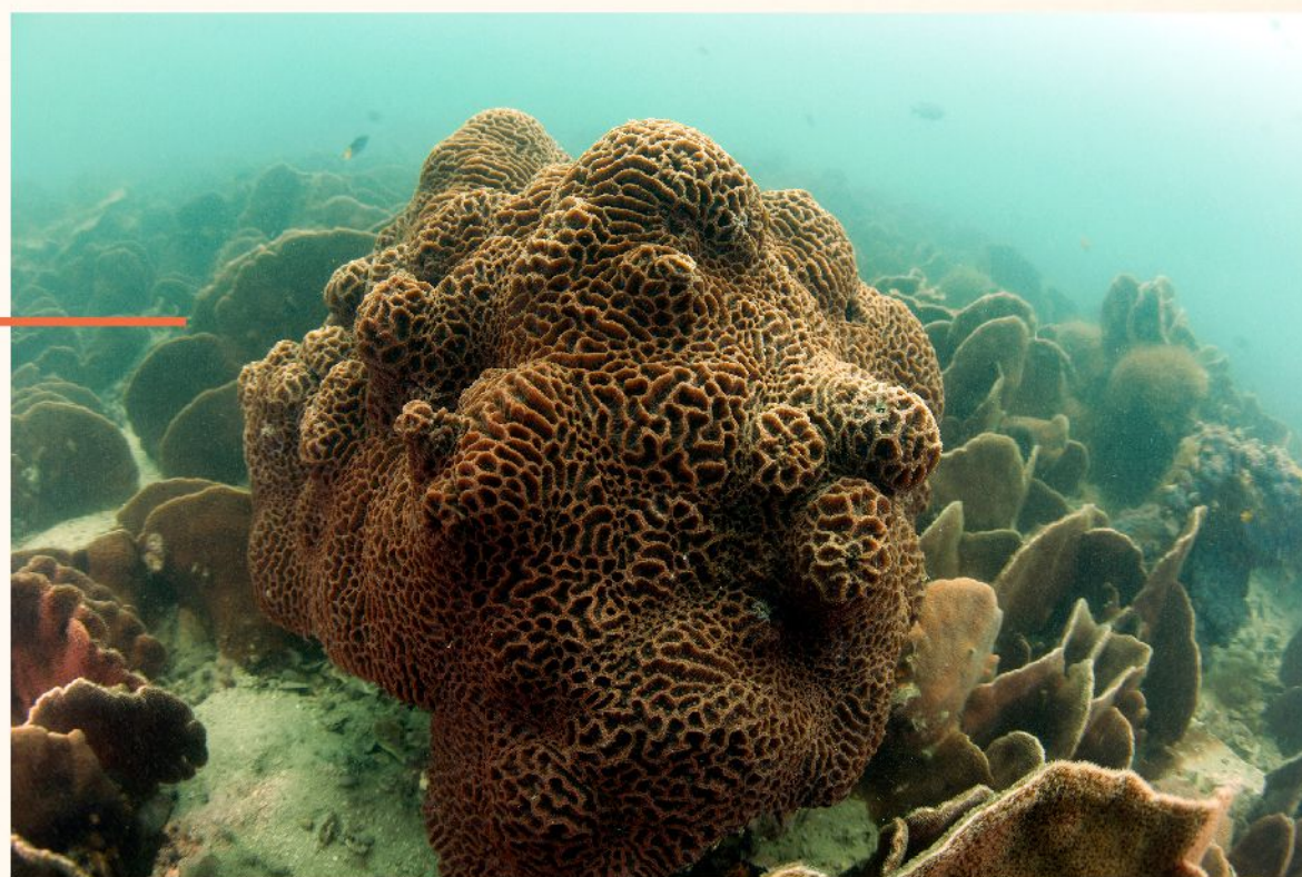
Flagship coral species, Platygyra , in northeastern Hong Kong waters