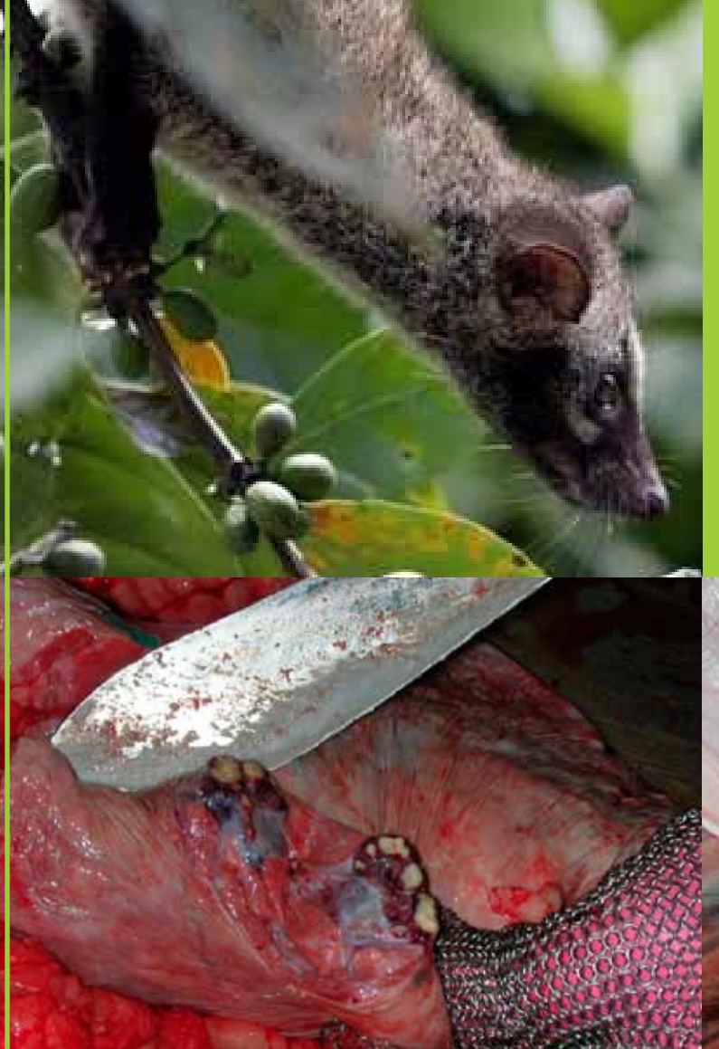
Civet Cat associated with SARS virus

Finally, one can from time to time get something which is extremely worrying. Smallpox (天花) was eradicated in the world decades ago. Yet in 2003 in America 93 people suddenly started developing classical signs of smallpox. For a moment the whole world literally held its breath. Then it was found out to be monkeypox (猴痘病), a disease which was first associated with animal illness in Zaire and West Africa during 1970 – 1971. The American's pet prairie dogs had been exposed to an African Gambian pouched rat. Fortunately, all the Americans recovered.