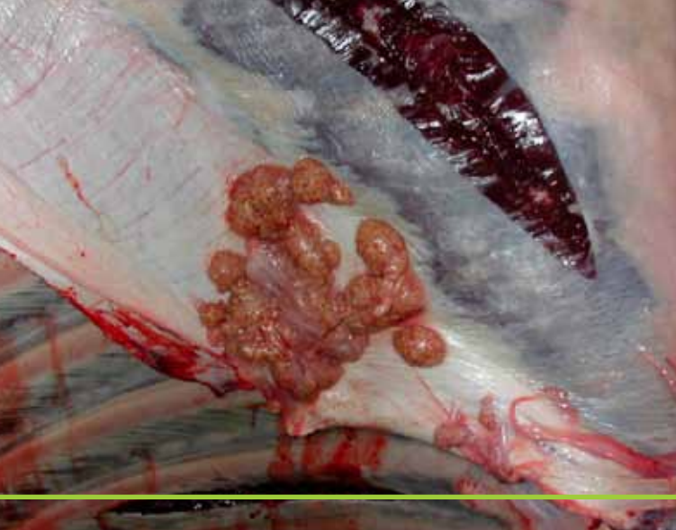
Tuberculosis found in cattle