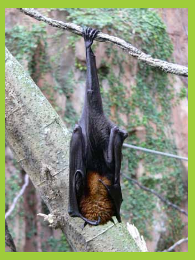
Fruit Bat associated with Nipah Virus

In one sense the world is getting smaller. The rise of these diseases is worrying. However, there is in place a reasonable solution. Underlining any solution to these new problems is international cooperation and the quick and free exchange of ideas and information. This is now achieved in two ways. The first is the informal discussions between experts and the use of specialist web sites such as Promed (www. promed.org). These were for example useful in the SARS outbreak. The second which is of great use and