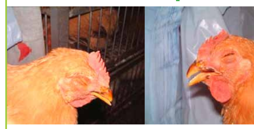
Birds suffering from Bird Flu