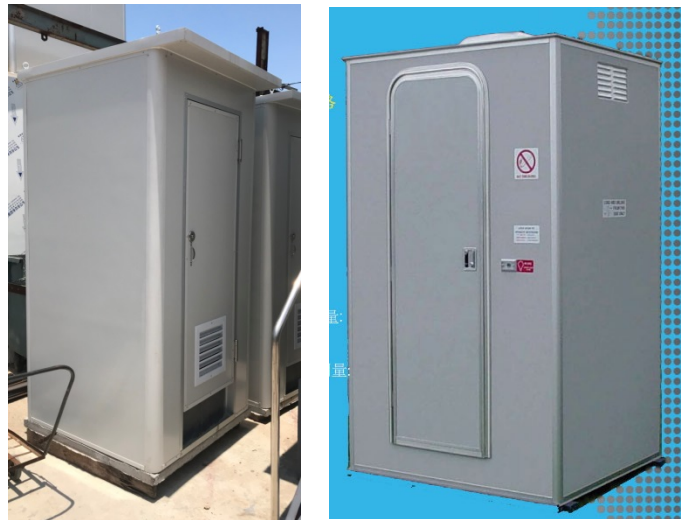
Figure 1 - Example of an Aluminum Alloy framed Portable Toilet