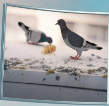
破壞環境衛生 Affect environmental hygiene