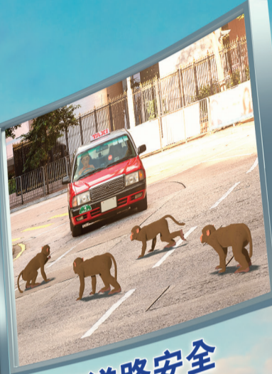
影響道路安全 Affect traffic safety