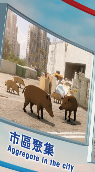
市區聚集 Aggregate in the city