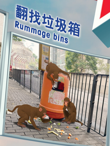
翻找垃圾箱 Rummage bins