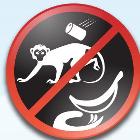
切勿狩獵，傷害或餵飼 任何野生動物 Don't hunt, hurt or feed any wild animal