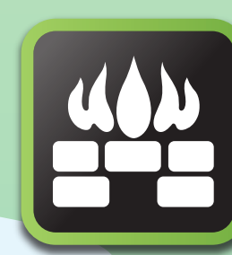
只可在指定燒烤或 露營地點生火 Use fire only in designated barbecue sites or camp sites

以上所列並非盡錄郊野公園及特別地區內受管制的活動。有關詳情，請參閱香港法例第208A章《郊野公園及特別地區規例》、第170章《野生動物保護條例》和第96章《林區及郊區條例》。