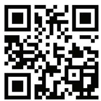
郊野公園指定露營地點 Country Parks Designated Camp Sites