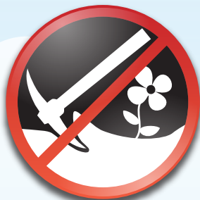
切勿損害任何植物 或擾亂土壤 Don't damage any plant or disturb soil