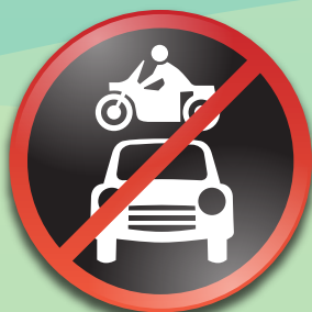
未經許可，切勿駕駛 車輛進入郊野公園 Don't drive your vehicle into country parks without a permit