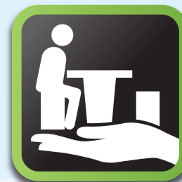
愛護公物 Take good care of public facilities