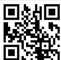
郊野公園越野單車徑或地點 Country Parks Designated Mountain Bike Trails and Sites