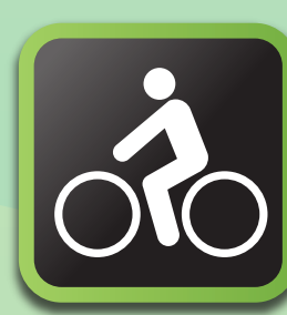
只可在指定的越野單車徑 或地點踏單車 Ride bicycle only in designated mountain bike trails and sites