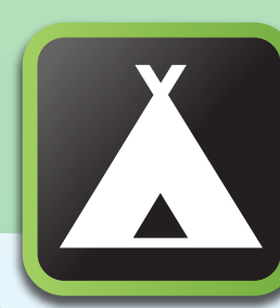
只可在指定露營地點 露營或建立帳幕 Camp or erect a tent only in designated camp sites