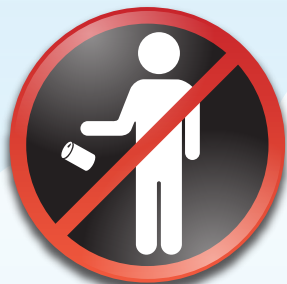
切勿亂拋垃圾 Don't litter

市民遊覽郊野公園及特別地區時，應留意《郊野公園及特別地區規例》和其他有關保護野生動植物和自然環境的法例，違例者可被檢控。郊遊人士請特別留意以下各點：