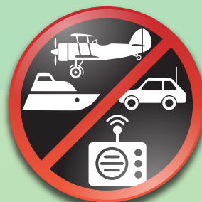
切勿操縱任何動力驅動的模型 飛機、模型車輛或模型船 Don't operate any power driven model aeroplane, model vehicle or model boat