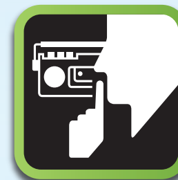
盡量降低聲量 Keep the voice down