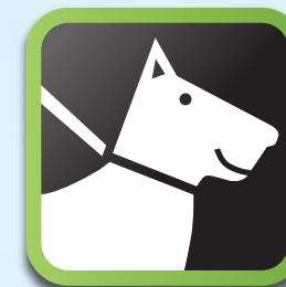
妥善控制你的狗隻 Control your dog