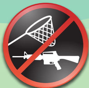
禁止攜帶任何獵捕 或陷阱類器具或槍械 Don't carry any hunting or trapping appliance or arms