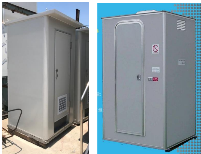
Figure 1 - Example of an Aluminum Alloy framed Portable Toilet